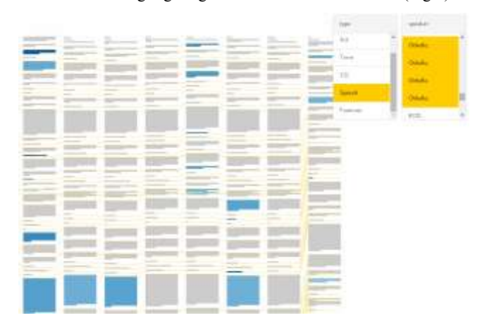
Figure 3: Sketched multiple parallel text view

We still need a flexible view on multiple parallel texts. Studio Nand has produced sketches for such an interface ([23, 25]), which re-scales (zooms) smoothly between close reading views and distant comparative views of structure and selected analytic features, allowing for multiperspectival filtering, sorting, and ondemand feature highlighting. A mid-scale view is shown (Fig.3).