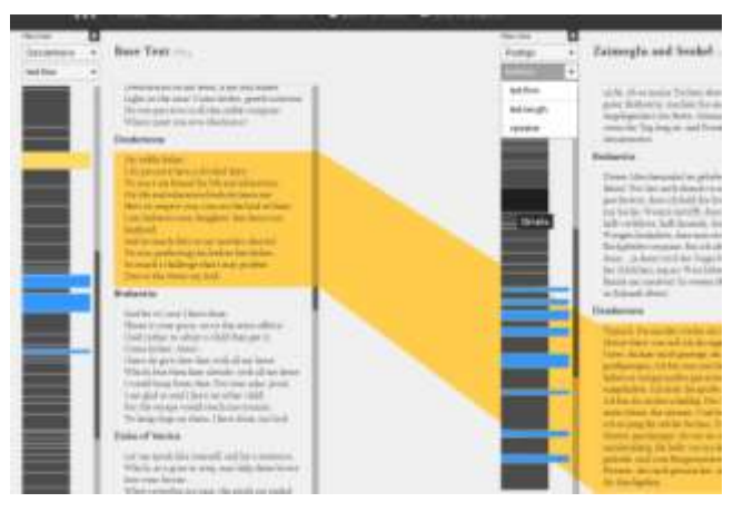
Figure 2: Dynamic parallel text navigation

structure of our English base text; play texts are structured as series of speeches by speakers (character roles), interspersed with stage directions. Here each right-hand strip represents the speechstructure of a German version. Each horizontal bar in a strip represents a speech; its thickness denotes length in words. Connecting lines denote alignments. We can see at a glance where versions expand, contract, omit, add, or re-order, relative to the base text, and to each another.