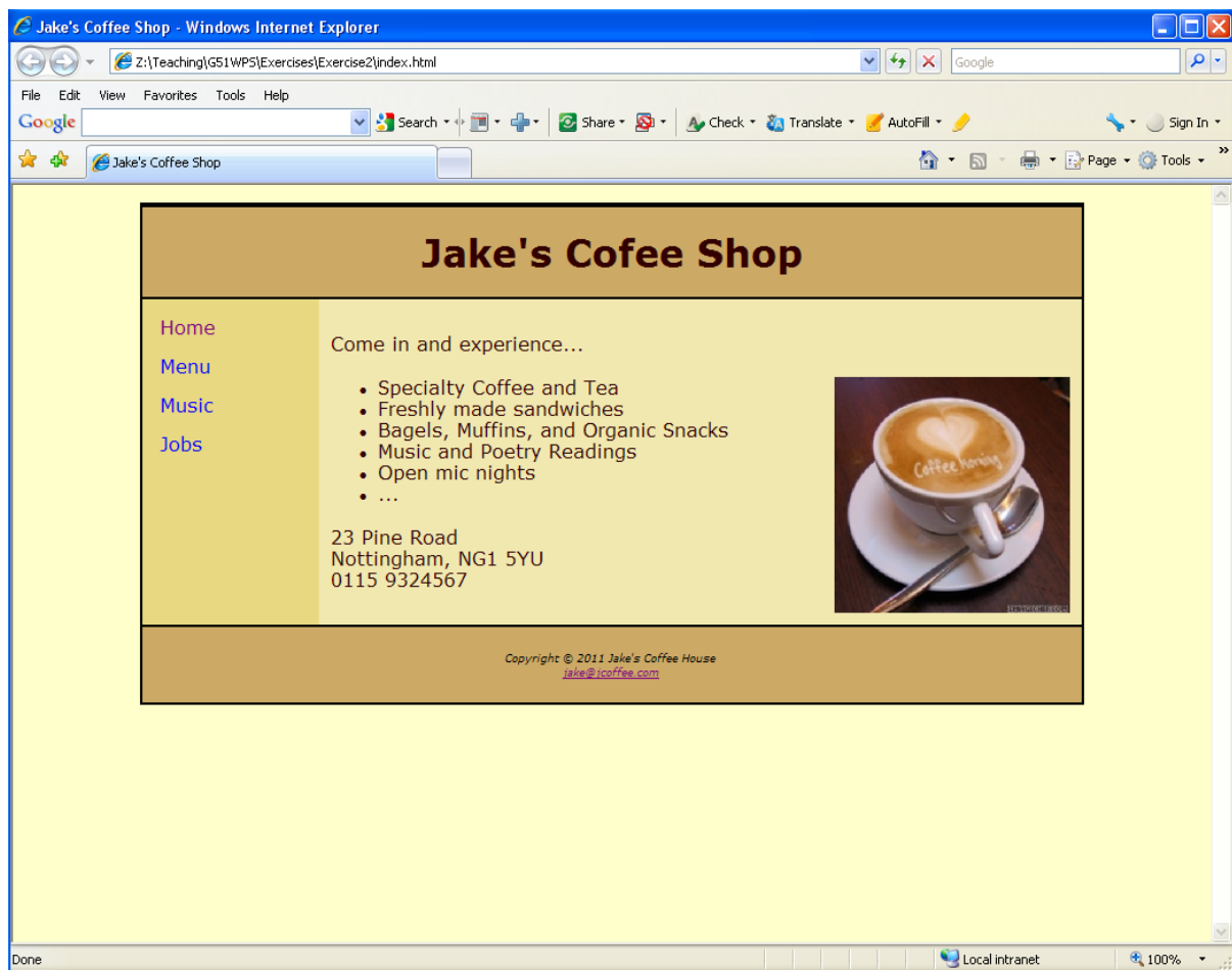
Figure 2. Display of Exercise2.html with CSS