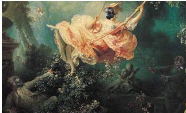
Figure 2. Appropriated image of The Swing by Fragonard

The overall ride experience was inspired by the painting ' The Swing ', by Jean-Honore Fragonard [7]. The painting reportedly [11] depicts an erotic scene involving three people: a woman riding the swing, a voyeur in the bushes watching the woman's exposed legs, and a bishop controlling the swing via a pull rope. Figure 2 shows an appropriated image of The Swing (with additional gas masks), which was used in the promotional material for the Breathless event.