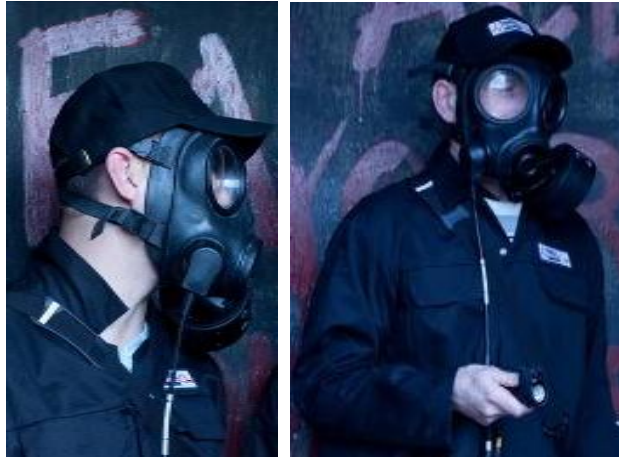
Figure 5. Gas mask and infrared torch camera

Once the first pair completed the maze, the roles switched over, with the first pair watching, and the second pair going into the maze.