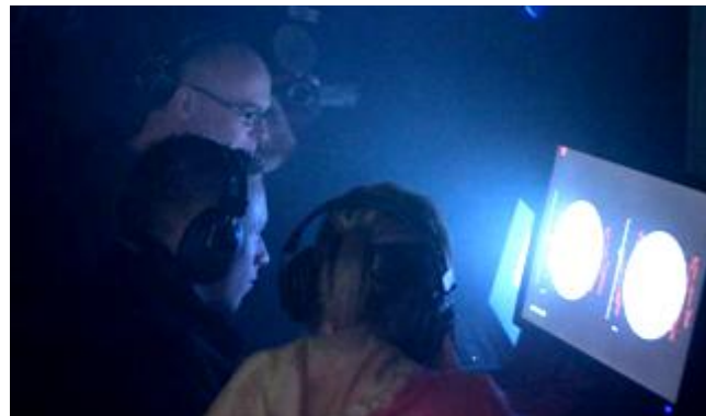
Figure 6. Watching transmitted video and breathing data

This created an interesting dynamic; the second pair, who had already heard the screams of the first pair,