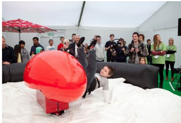
Figure 3. The Broncomatic

In studies of the Broncomatic, both first time and repeat riders reported strong levels of enjoyment. The Broncomatic has been shown in various locations since the initial development, and is currently part of a long-term invited installation at the National Videogame Arcade, UK.