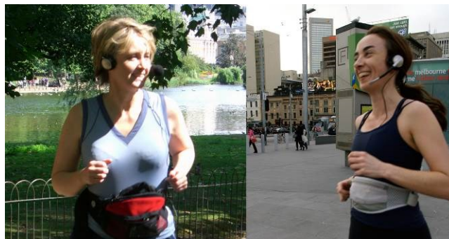
Figure 2. Jogging Over a Distance