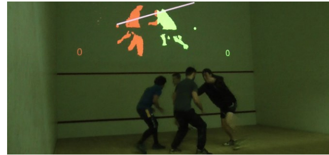
Figure 4: Players and the screen in Balance of Power