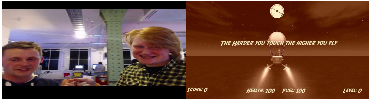
Figure 2: Touch-O-Matic Airship Adventures

A Thrilling Discomfort: Playing Airship Adventures requires people to touch each others' skin gently for extended periods of time. This is an unusual and uncomfortable experience for many people, due to an association of gentle touch with intimacy. The touching involved in this game is a deliberately 'uncomfortable interaction' [1], with players expressing a real mixture of discomfort and pleasure. Because it doesn't constrain touch, at the beginning of games, players can be seen to negotiate about how they are comfortable to touch; for example one pair of male players even enlisted a third female friend to stand between them because they were uncomfortable with touching another man.