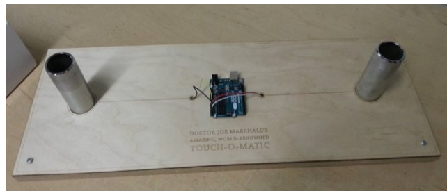
Figure 1 Desktop Touch-O-Matic Controller

In this paper we describe player experiences of two games which use physical touch between players as an input, and discuss further research and technical challenges for interpersonal touch interaction.