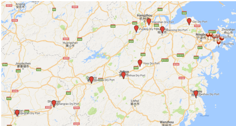
Fig. 1 The locations of 19 container terminals of the logistic company. The balloon icons represent dry ports and the ball stick icons represent harbors. The nine harbors locate along the coast of Ningbo City, while the 10 dry ports are either inland or far from the Ningbo coast.

The problem studied is a container transportation problem faced by a logistic company at Ningbo Port, which is the second largest port in China. Every day, the company has to transship a number of commodities, each consists of a number of containers. Every commodity has a specific service time constraint. These commodities are transited among 19 container terminals including harbors and dry ports (see Fig. 1). There is a fleet of 250 trucks, whose depot locates at the Ningbo coast. Every day, the trucks leave the depot with a list of transport tasks and return to the depot after completing all the tasks.