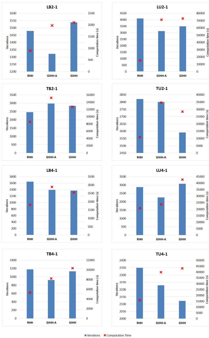
Fig. 3 The iteration times and computation time of the three algorithms on eight sample instances.

In addition, as mentioned in Section 3.3.1, another variant adopting the Record-to-Record Travel acceptance criterion (GIHH-RRT) is also compared