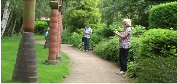
Figure 4. Standing back from Chimney Stacks

Finally, other instructions were challenging because they demanded impossible actions, for example "This man has brought you an apple. Why don't you take it and put it in your pocket? Or maybe you would like to eat it?" at Golden Delicious couldn't be followed literally. Most visitors were not able to interpret it as a clear instruction for action and remained stood still in front of it. However, a few (only 5 out of 29) made attempts to touch or grab the apple.