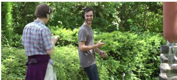
Figure 5. Exchanging glances while engaging

There were, however, many examples of tacit coordination in synchronizing engagement with sculptures. We noted earlier that pairs generally tried to begin their engagement together. However, the two devices were not technically synchronised and so there was often a few seconds delay between them. We often observed a quick exchange of glances and smiles between pairs to confirm that they had heard the instructions before both had followed them.