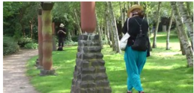
Figure 6. One partner waits while the other replays the music

Physical contention for the sculptures was usually not a problem as the garden was relatively quiet, but there were a few problematic cases where limited physical access meant that one partner had to wait for the other, for example at The Shrine at Nemi where visitors are invited to climb the steps and look through a small aperture. Chimney Stacks provided another example of coordinating actions, with cases of one partner following the other, sometimes copying their actions in solidarity, but with at least one case of one partner marching ahead and the second following with reluctance. Local coordination was also evident when one partner would wait nearby while the other replayed a music track before both moved on together, as we see in Figure 6 where one partner takes photos while the other repeats her experience at Chimney Stacks .