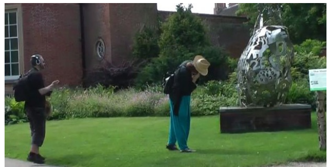
Figure 3. Reading the text at The Hand

Instructions that required a slightly higher level of physical engagement, such as touching a sculpture or adopting a pose, were often followed. Upon hearing an instruction, most visitors did not hesitate before carrying it out and remained physically engaged throughout the music. For example, at Two Vessels (“ Take your hands and move them down the pillar to feel the texture ”) visitors would typically hear the instruction, approach the sculpture to begin feeling it, and remain at the sculpture, touching it and looking at it, until the music had faded. This level of compliance at Two Vessels was displayed by 22 out of the 29 visitors (as shown in Figure 2). Most visitors welcomed being given license to touch the sculptures: “ I especially liked ones where it was like ‘touch it’, because I always want to touch sculptures and I’m never sure if you’re really meant to ”. Indeed, we observed that once instructed to touch one sculpture, visitors became more tactile with subsequent sculptures. However, some remained nervous at breaking what is seen as a taboo behaviour: “ I’m very conscious of walking through art when you’re not allowed to touch ... the very first one it said ‘what does it feel like?’ and I just thought, I can’t touch it, surely? ”