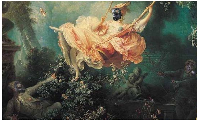
Figure 2. Appropriated image of The Swing by Fragonard

The overall ride experience was inspired by the painting 'The Swing', by Jean-Honoré Fragonard [7]. The painting reportedly [11] depicts an erotic scene involving three people: a woman riding the swing, a voyeur in the bushes watching the woman's exposed legs, and a bishop controlling the swing via a pull rope. Figure 2 shows an appropriated image of The Swing (with additional gas masks), which was used in the promotional material for the Breathless event.