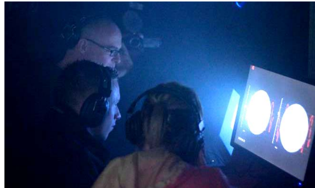
Figure 6. Watching transmitted video and breathing data

This created an interesting dynamic; the second pair, who had already heard the screams of the first pair, had an increased level of fear about the maze. The following