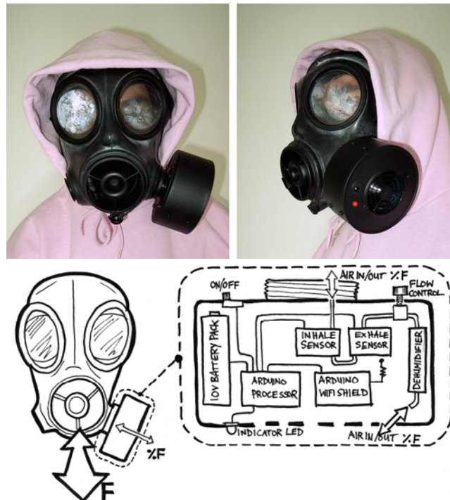
Figure 1. Gas Mask and Respiration Monitor

The microprocessor records readings from both the flow sensors at 20Hz, and transmits them on a WIFI network using local broadcast. This allows us to obtain low latency inhalation and exhalation rates, while the