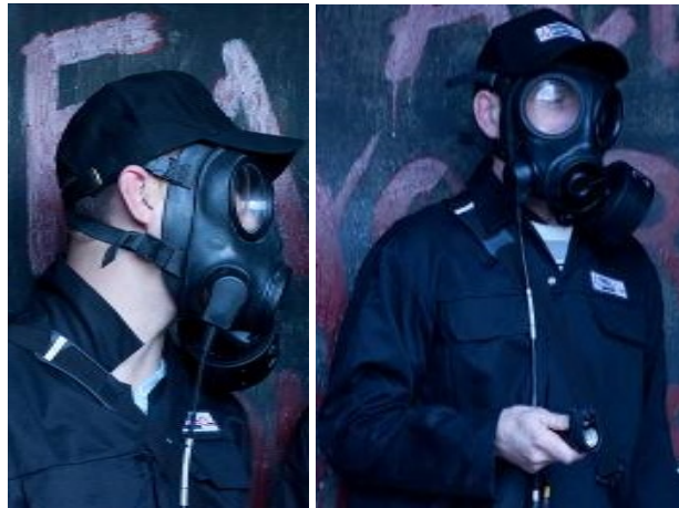
Figure 5. Gas mask and infrared torch camera

maze, the roles switched over, with the first pair watching, and the second pair going into the maze.